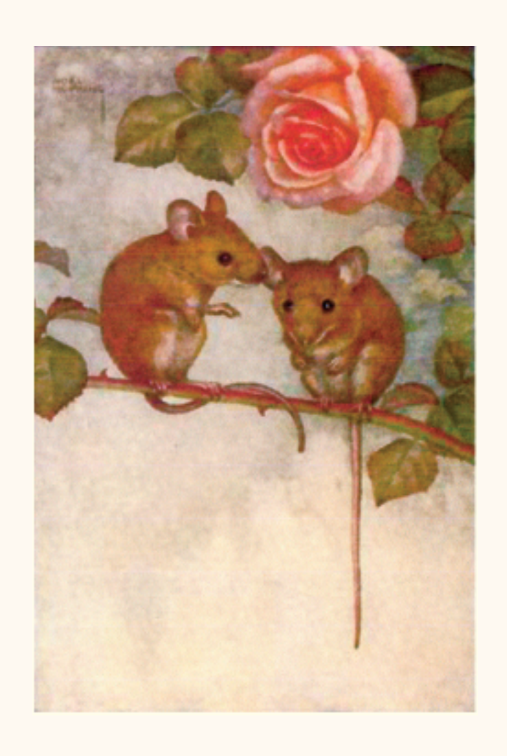
"Our Wedding Play"